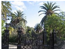
Williamston Botanic Gardens are maintained by the City of Hobsons Bay.